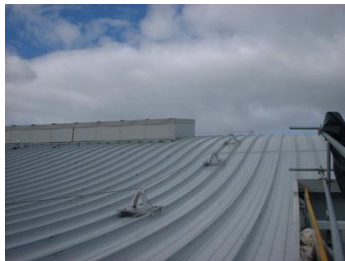
Caption: Safety Cables on the roof of ABC

All skyway posts are designed to have minimal impact on other trades and they are the easiest posts in the industry to install and weather. Skyway is the only company to supply full weathering kits on membrane roofs such as: Tegral Sarnafil, Zebith, Braas and others.