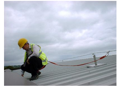
Caption: XYZ working on the roof of ABC