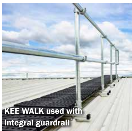
KEE WALK used with integral guardrail