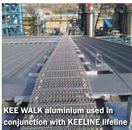
KEE WALK aluminium used in conjunction with KEELINE lifeline

Can be used in conjunction with others products to provide a complete fall protection plan.