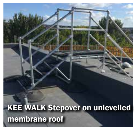
KEE WALK Stepover on unlevelled membrane roof